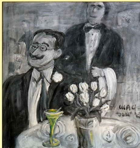
"A Table for Two", WA Guy (2002)